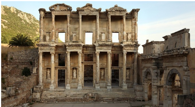
The remains of the ancient library in Ephesus.